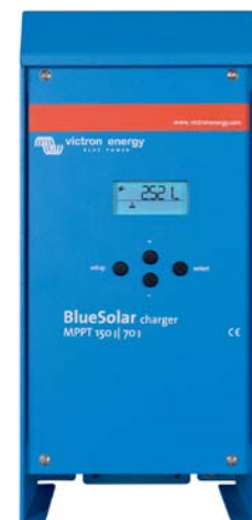
150/70 & 150/85 CAN-bus