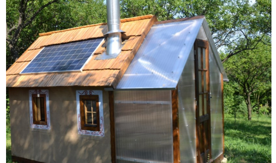
0.7KW Jinko Solar Panels