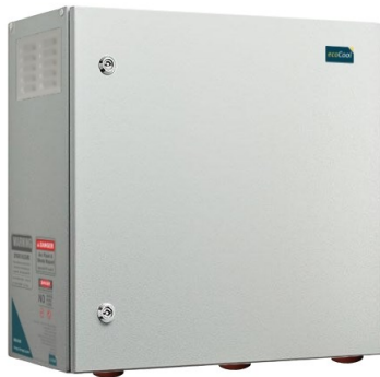
Off-grid System Enclosure 600Wx600Hx300Dmm K28.1200.G.29