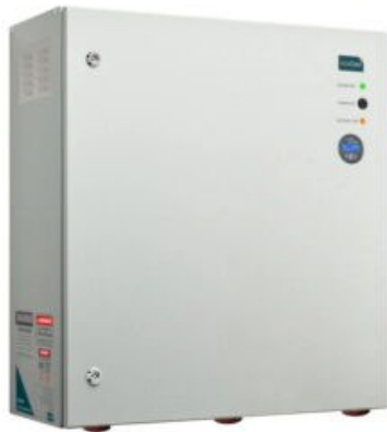
Off-grid System Enclosure 800Wx800Hx400Dmm K28.2000.G.96