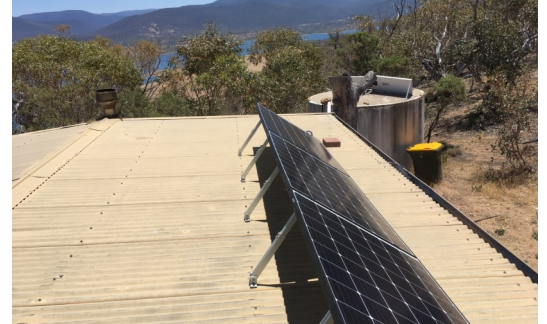
1.5KW Jinko Solar Panels