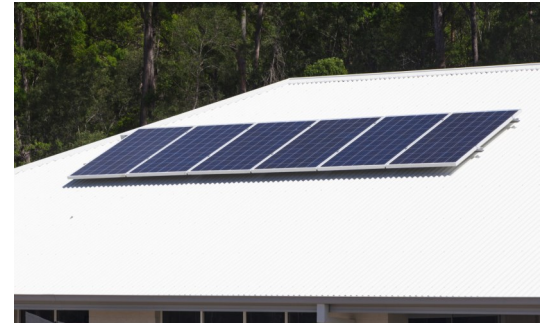
2.4KW Trina Solar Panels