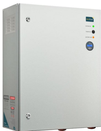
Off-grid System Enclosure 800Wx1000Hx400Dmm K28.3000.G.96